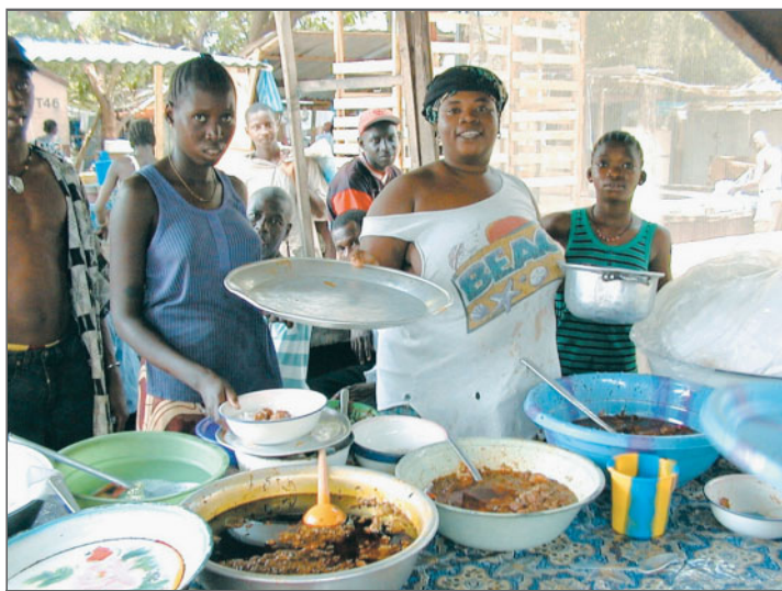
Food Seller, Gambia.

The coexistence of underweight and overweight poses a challenge to public health programs, since the aims of programs to reduce undernutrition are obviously in conflict with those for obesity preven-